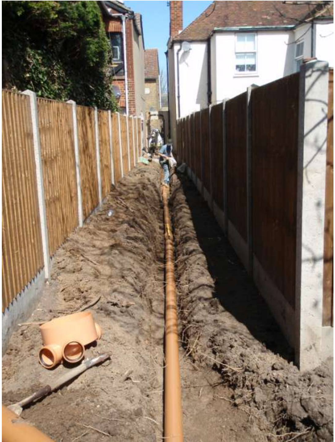
Plate 4. View of Phase 1 laying drainage ditches (looking north)