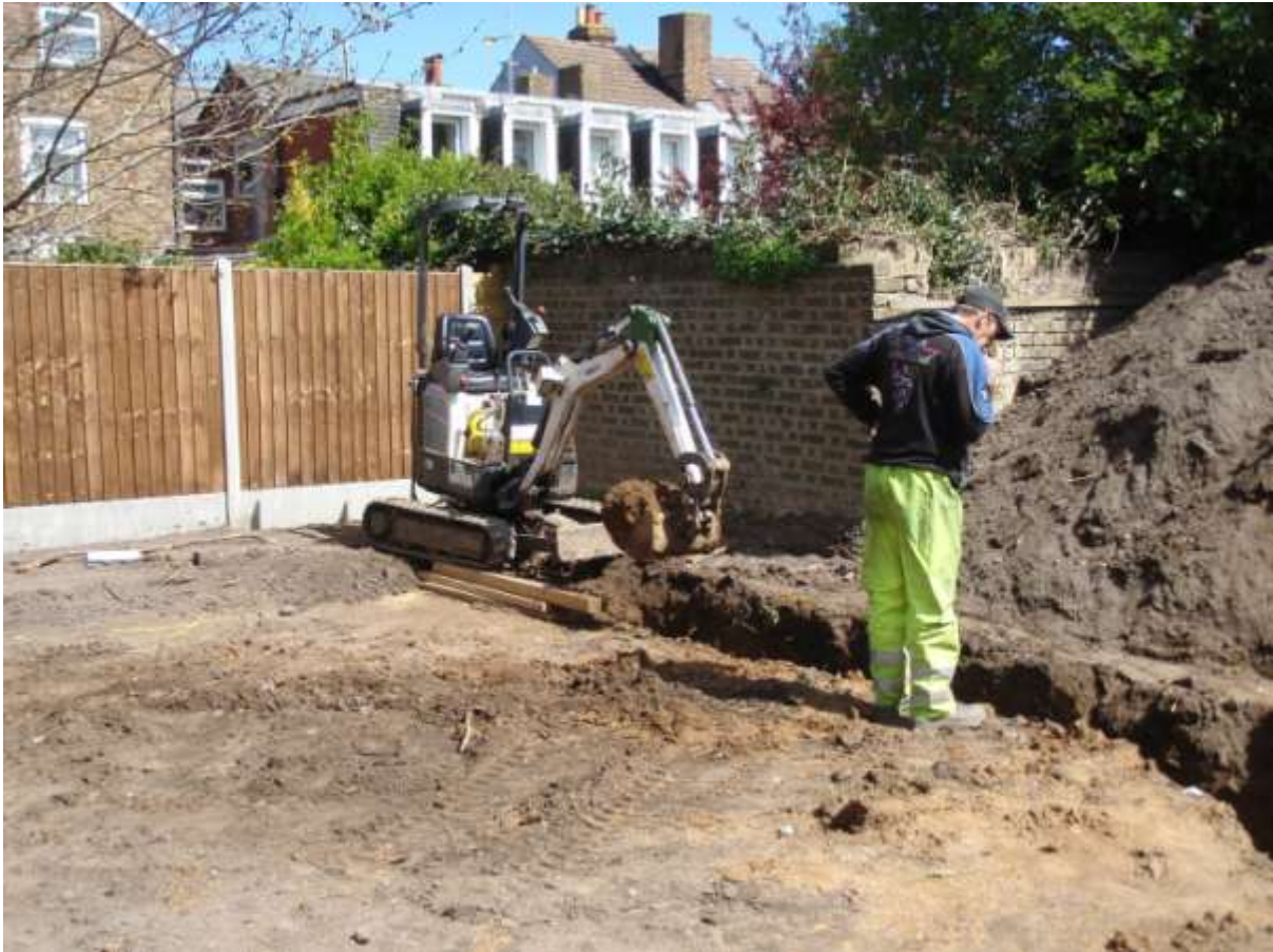
Plate 7. Cutting of foundation trenches –Phase 3 (looking north-east)