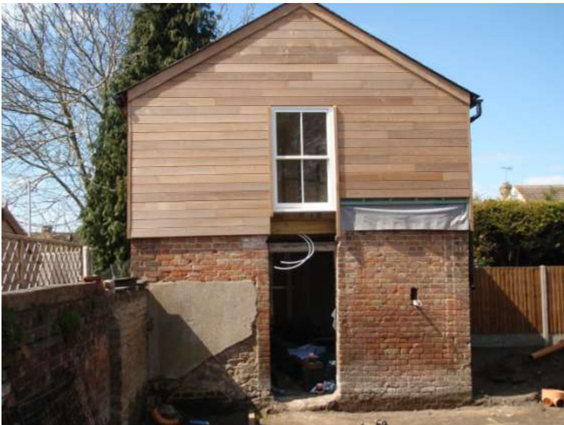
Plate 3. View of the renovated outbuilding (looking west)