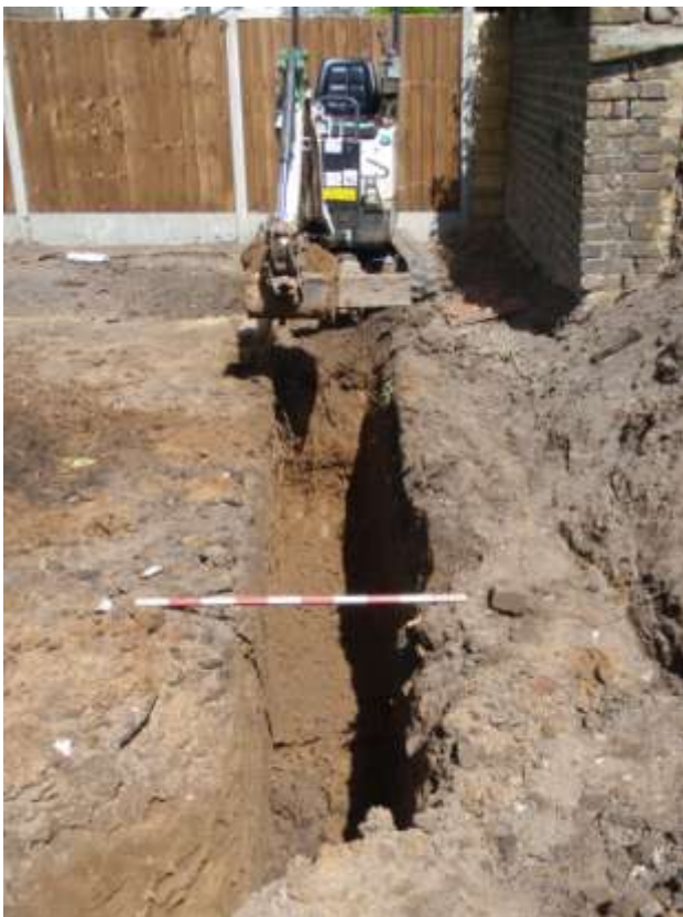
Plate 8. Cutting of foundation trenches