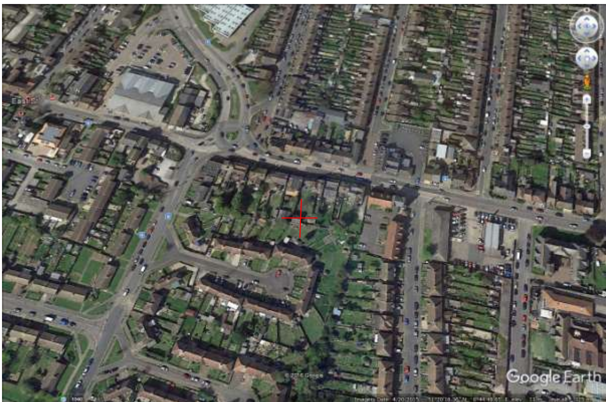
Plate 1. Aerial view of site (red target) showing the site prior to development.

(Google Earth 20/04/2015: Eye altitude 325m).