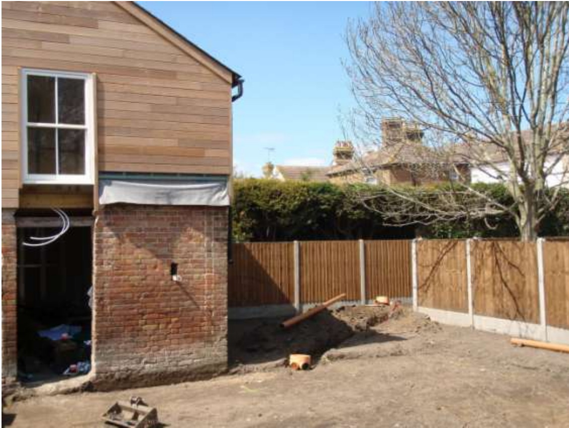
Plate 2. General view of site showing the renovated outbuilding (looking north- west)