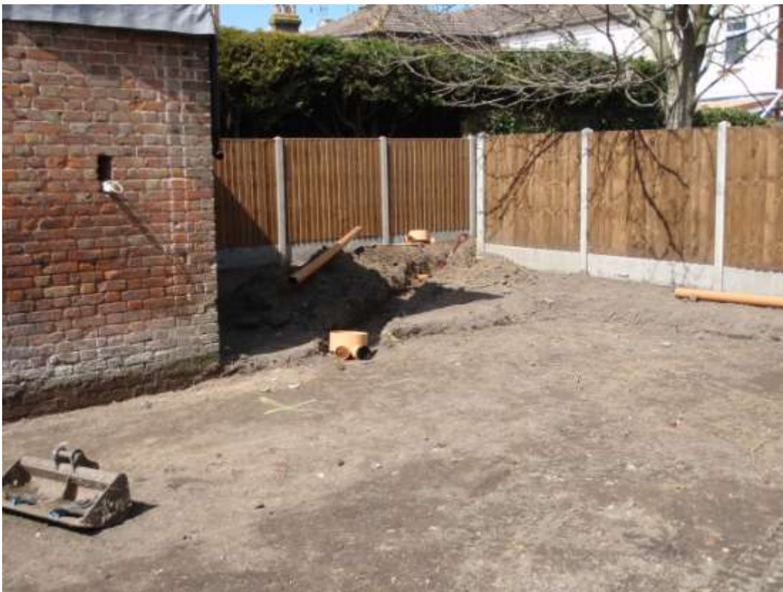
Plate 6. View of reduced site and final drainage work (looking north-west)