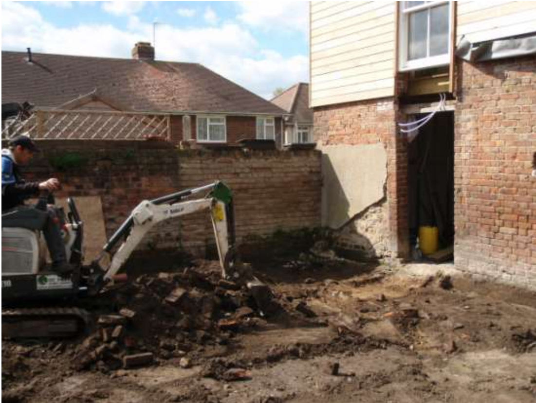
Plate 5. Phase 2. Ground reduction (looking south-west)